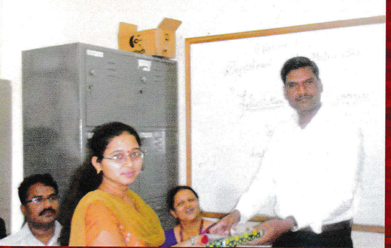
Felicitation of toppers in Mathematics.