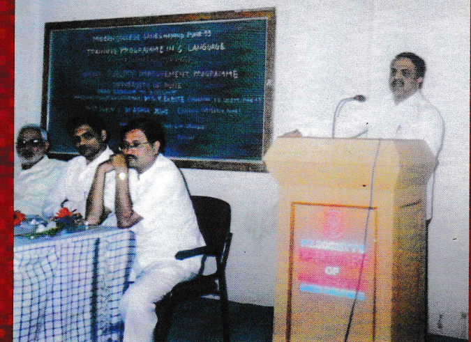
Training Programme in C language organised for faculty members under QIP (BCUD)