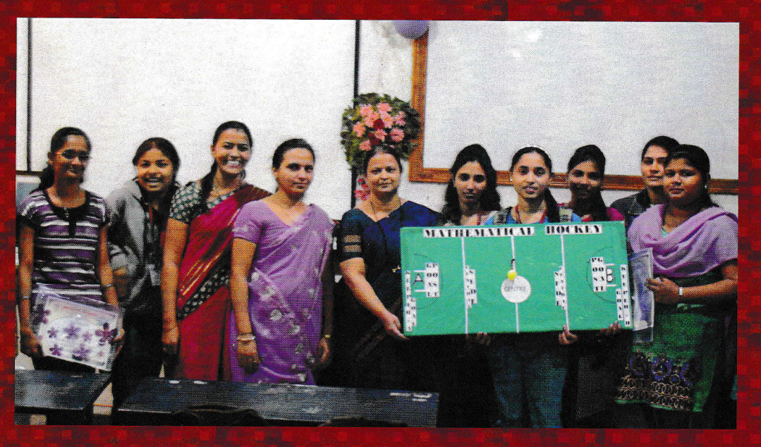
Game based on fast computation skill in Mathematics in the syllabus "Mathematical Hockey"