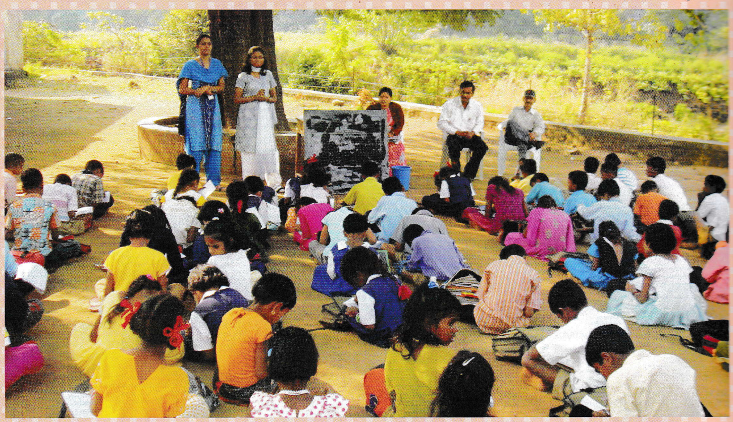
Staff conducted "Fun with Mathematics" for school children.